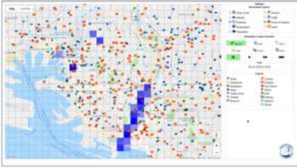
Figure 2: GUI: Points of interest (icons) and the flooded area (blue squares) on the map